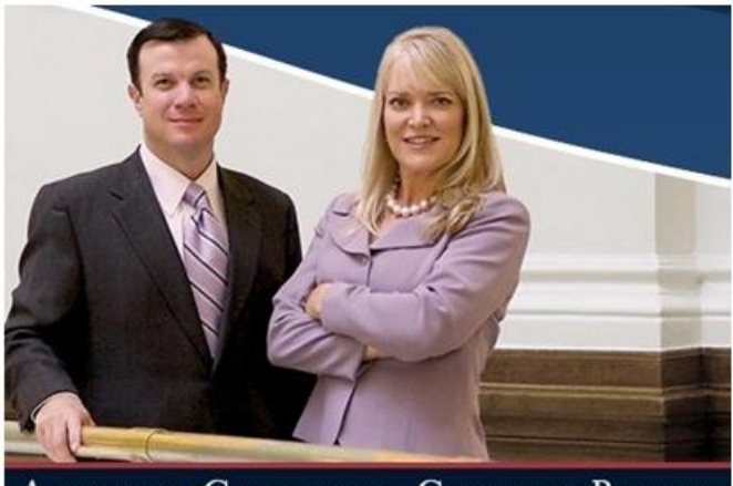
Advocacy - Grassroots - Coalition Building

The Texas Legislature adjourned their regular session back on Memorial Day, nearly one month ago. But when lawmakers were not able to come to a compromise on giving Texans property tax relief, Gov. Greg Abbott called them back into an immediate 30-day special session which ends later this week. We heard today that the Texas House GOP Caucus has advised members to expect another special session on June 28th: "Expect to be called back for a second special session this Wednesday afternoon," according to the memo.